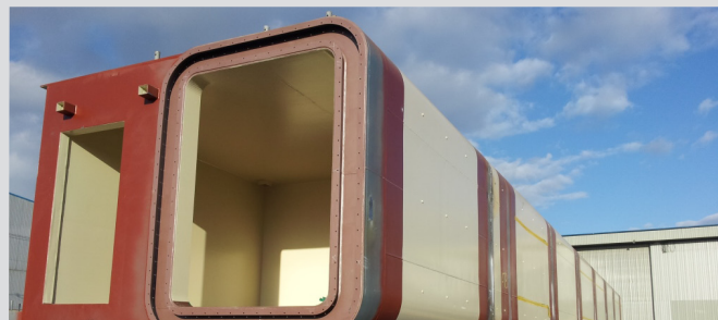
Blast and fire proof escape tunnel

As new panels SPS is constructed using thin steel face plates bonded by a solid elastomer core to form a stiff, lightweight panel. The elastomer core provides continuous support to the face plates, prevents local buckling and, in many cases, removes the need for secondary stiffeners.